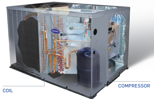
50ZP PACKAGED AIR CONDITIONER SHOWN

The 50ZP packaged air conditioner and 50ZH packaged heat pump are built to look their best while enduring exposure to hail, errant soccer balls, lawn equipment and more.